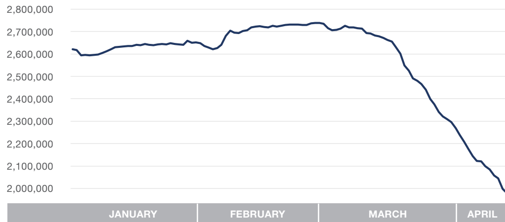
LinkUp 10,000 | Total job openings for the 10,000 global employers with the most job openings in the U.S. employers